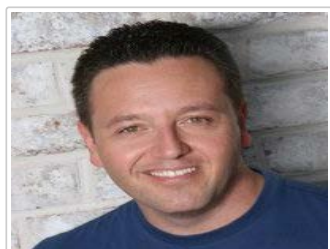
John Edward Psychic Medium

e.g. psychics, mediums, spiritual coaching